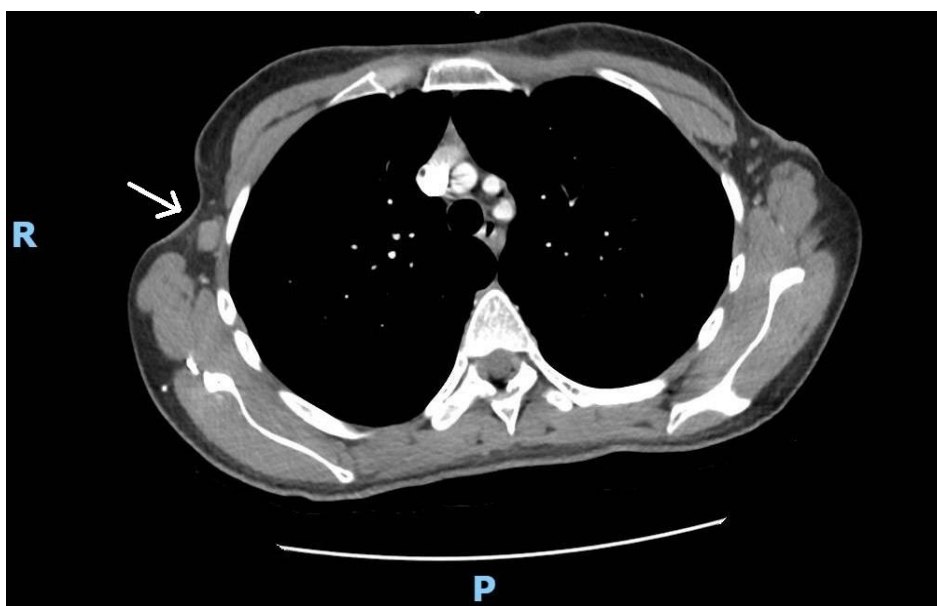
Figure 3: CT scan (axial) showing an enlarged lymph node.

She underwent further imaging including Magnetic Resonance Imaging (MRI) breasts, staging Computed-Tomography (CT) and Bone Scintigraphy that revealed no evidence of disease in her orthotopic breasts or any metastatic disease. She proceeded to have a re-excision of margins, sentinel lymph node biopsy and infusaport insertion. Histopathology showed no residual cancer within the re-excision but 1 of 3 sentinel lymph nodes positive with a macrometastasis with focal extracapsular extension. She proceeded to a level 2 axillary clearance with a further 15 negative lymph nodes.