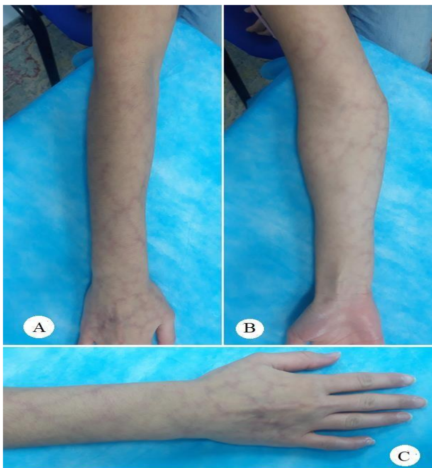
Figure 2: the lesion extends along the right upper limb, between the deltoid insertion proximally and the Metacarpophalangeal joints level distally, sparing the phalangeal skin dorsally and the palmar skin volarly.

Our clinical findings revealed a network of blue-purple lines giving the skin a marbled appearance along the right upper extremity from the deltoid insertion to the metacarpophalangeal joints level dorsally, sparing the Palmer skin, otherwise, her skin temperature and texture were normal, without atrophy or ulceration. (Figure 2)