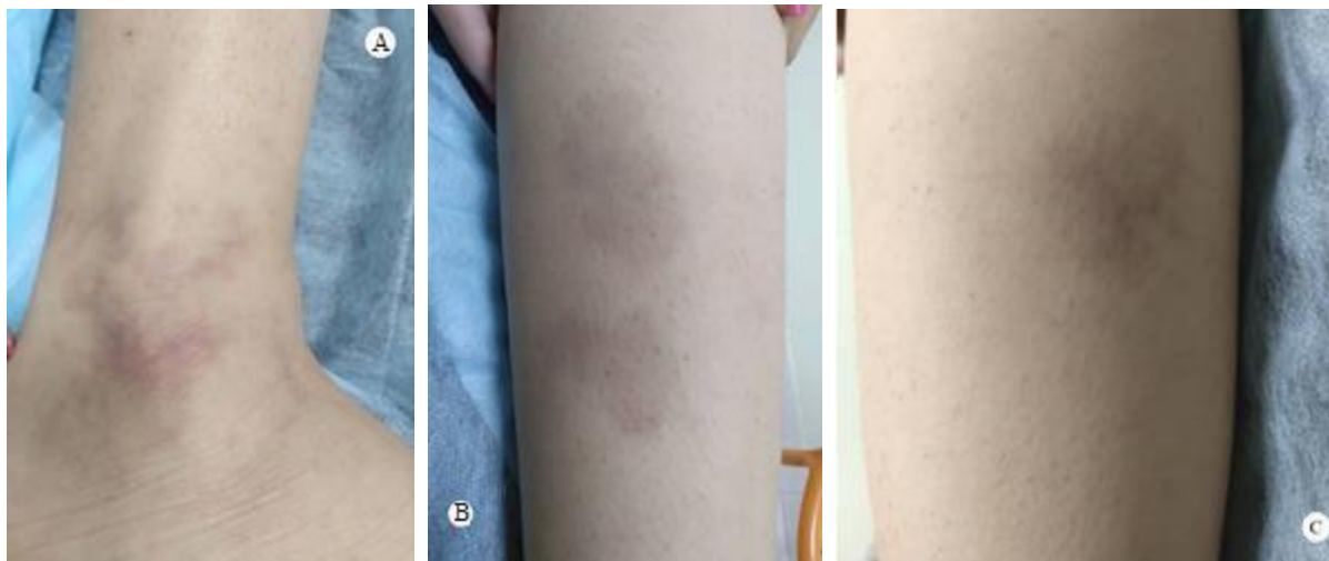
Figure 3: Multiple erregularly shaped port-wine stain patches on he ankle A, leg B, and thigh C.

wine stain patches on the right ankle laterally, left leg posteriorly, and the right thigh anteromedially.