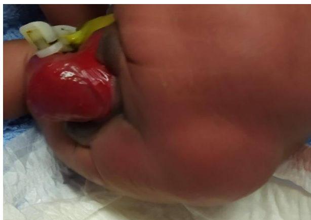
Figure 3: spina bifida occulta meningocele.

Medical imaging examinations were carried out to determine the nature and extent of the malformations. Cardiac ultrasound revealed an ostium secundum type inter-atrial communication of approximately 2.5 cm, the interventricular septum being intact (fig4). Abdominal and pelvic ultrasound concluded there was bladder exstrophy, with integrity of the intra-abdominal organs. The transfontanelar ultrasound showed a posterior superficial formation of pure anechoic content measuring 38 x 17 x 33 mm, that is 11 cc in volume, with an opening into the medullary canal, suggesting a meningocele, the dural sheath not being visualized in the mass. Moreover, the requested