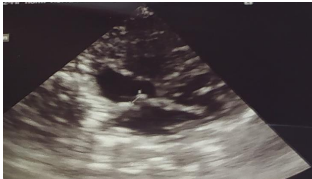
Figure 4: Ostium secundum type atrial septal defect of about 2.5 cm.

omphalocele incision and the reconstruction of digestive and uro-genital defects. The second step consisted of lumbosacral dysraphism menongoccele repair.