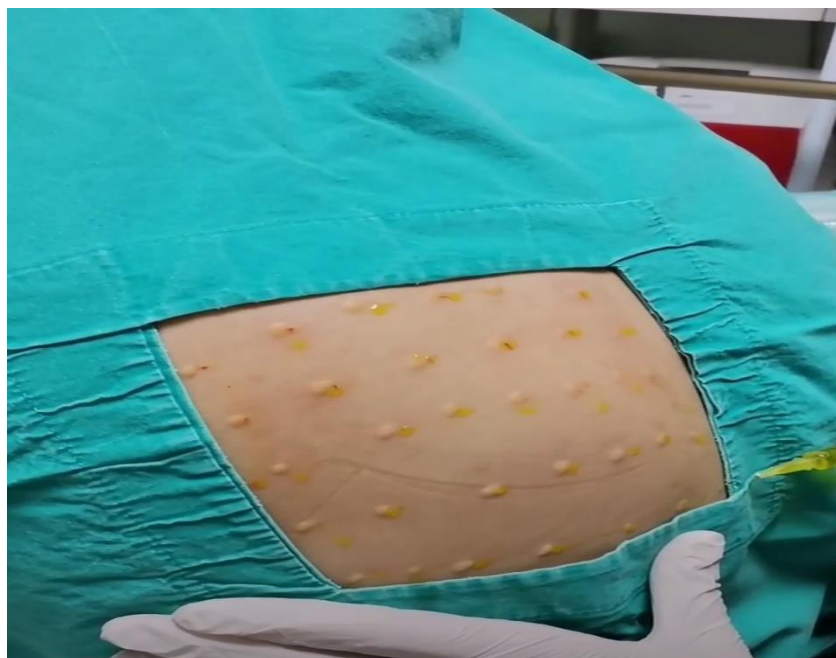
Figure 2: The sample photos showing intracutaneous injections in affected areas.

according to the order of arrival to the outpatient clinic and were divided into three groups. Patients in the first group (n: 23) were given oral diclofenac potassium, thiocolchicoside and cyanocobalamin treatment and patients in the second group (n: 17) were given intradermal mesotherapy containing 2% lidocaine + cyanocobalamin (figure 2).